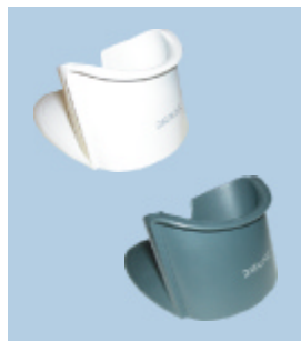
Gryphon™ Desk/Wall holders