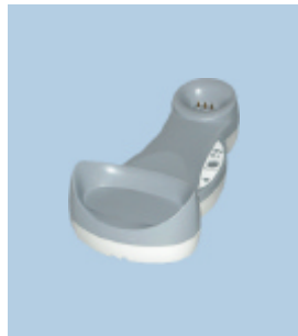
OM - Gryphon™/C-Gryphon™