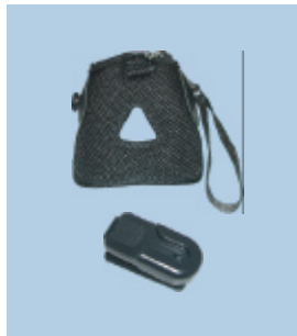
Gryphon™ Protective case